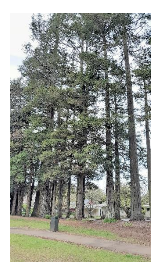
Figure 4: Showing another view of the sparse canopy area.