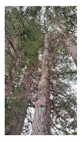
Figure 2: Showing tree #35 is dead.

These trees have been cleared around their bases which will significantly reduce water retention in this area. Application of mulch is a priority to help these trees through the summer.