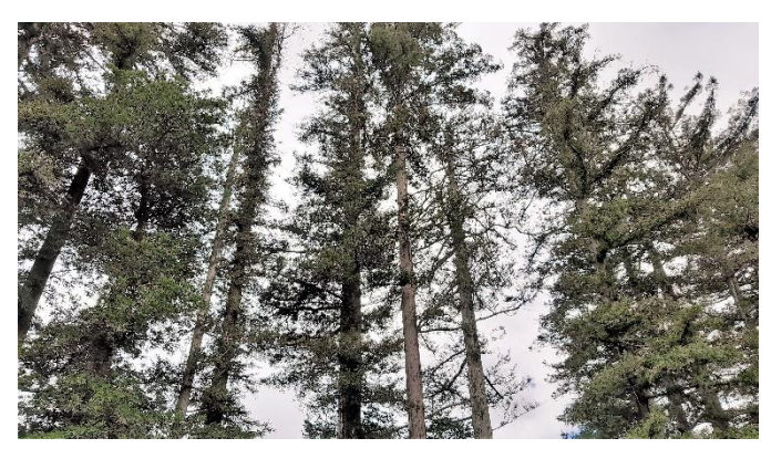
Figure 3: Showing sparse foliage.

Tree #35 should be removed at some time as eventually it will fall.