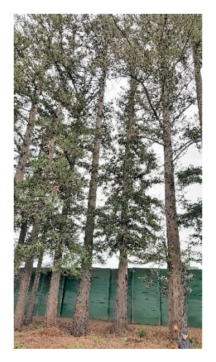
Figure 1: Showing vigorous coppice growth removal.

These trees have been cleared around their bases which will significantly reduce water retention in this area. Application of mulch is a priority to help these trees through the summer.